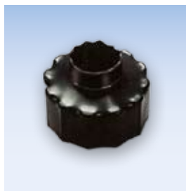
Shrink cap MK