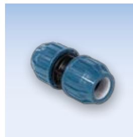
Plastic couplings MPP